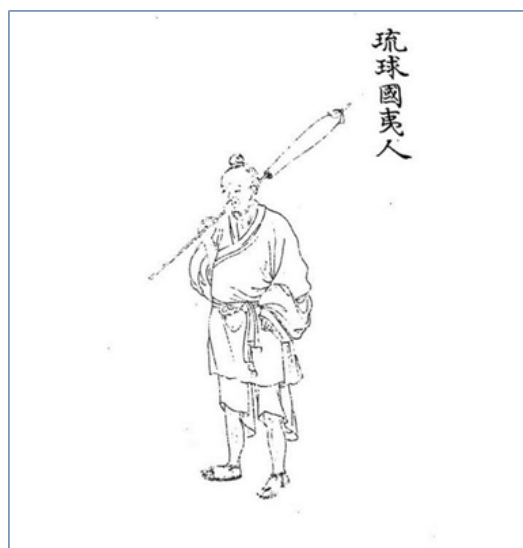
"Commoner from Ryukyu." In: Huang Qing Zhigongtu 皇清職貢圖 Siku quanshu 四庫全書 edition. (c. 1790)

Portal: Bibliothèque Nationale de France . < https://gallica.bnf.fr/ark:/12148/btv1b55010283d.item >. Accessed: 2023-11-27.