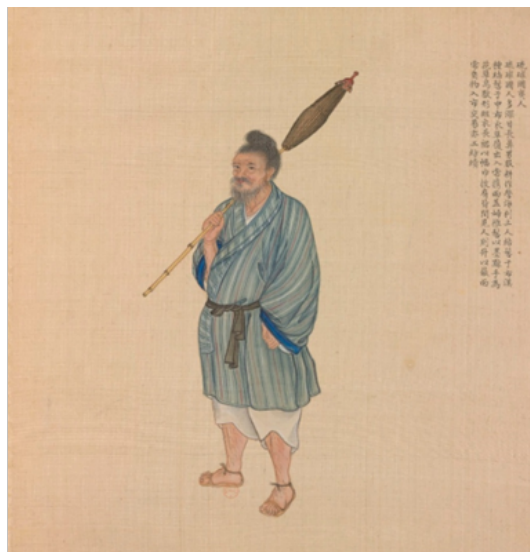
"Commoner from Ryukyu." In: Huang Qing Zhigongtu 皇清職貢圖 luxury edition. (c. 1790).

Portal: Bibliothèque Nationale de France . < https://gallica.bnf.fr/ark:/12148/btv1b55010283d.item >. Accessed: 2023-11-27.