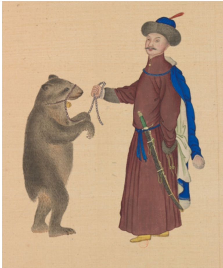
Polish man in Qing Imperial Illustrations of Tributary Peoples (Huang Qing Zhigongtu) . (Leiden, NL : Koninklijke Brill NV, 2022), p. 63.

The illustration below is from Jan Matejko's (1838-1893) Clothes in Poland 1200-1795 , a 19th-century album. It showcases the history of Polish attire through lithographic illustrations across various centuries and social classes, with editions published in 1860 and 1875. The work is patriotic and historical in nature, aiming to preserve the culture and tradition. (Czajka 2016, 123) It is seen as the most prominent example of a Polish costume book with accuracy depicting fashion details and social hierarchy. The "Noblemen 1697-1795" reflects the social status and cultural identity of the Polish nobility. Matejko's attention to detail in the fabrics, colours, and accessories of noblemen offers a vivid insight into the period's sartorial elegance.