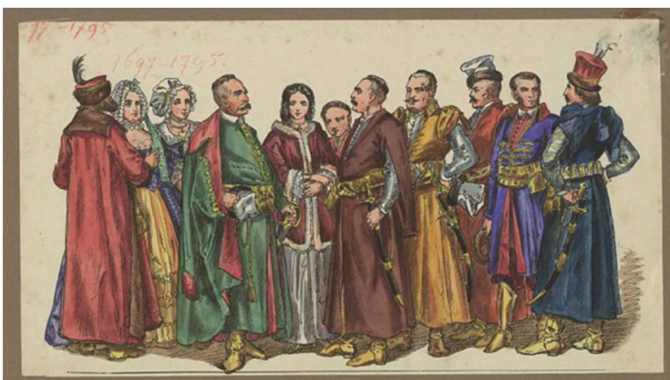
Matejko, Jan. „Noblemen 1697-1795” in: Ubiory w Polsce 1200-1795 , Cracow, 1875.

As an example, can serve depictions below: