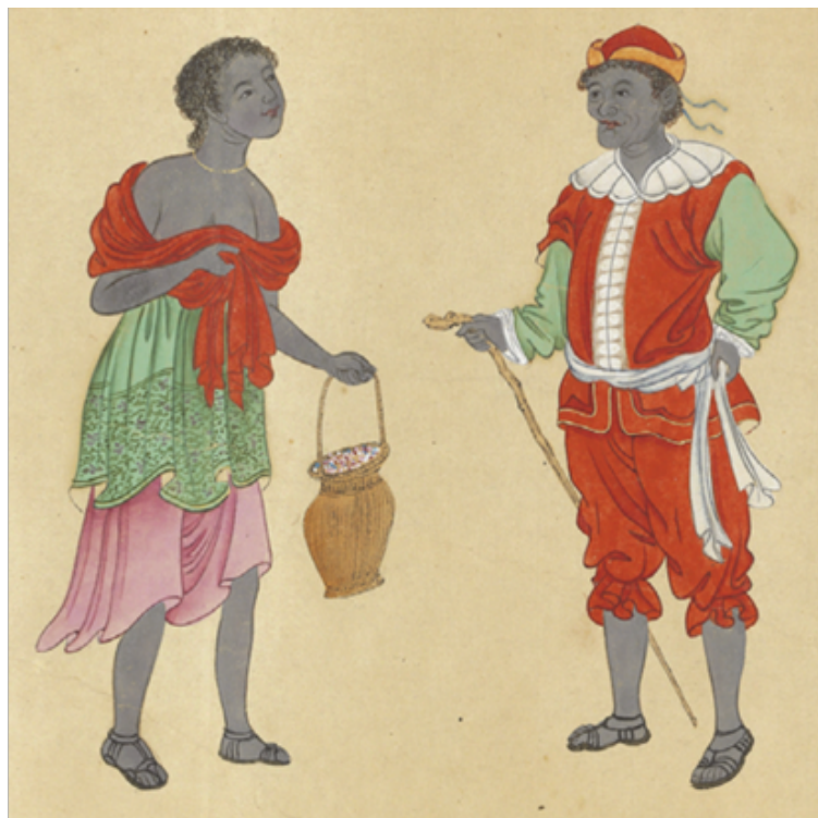
Daxiyanguo hei monu 大西洋國黑魔奴 (Black Demon Slaves) in: Qing Imperial Illustrations of Tributary Peoples (Huang Qing Zhigongtu): A Cultural Cartography of Empire . (Leiden, NL : Koninklijke Brill NV, 2022), p. 64.

The illustration's portrayal of a Polish nobleman incorporates a blend of traditional Polish elements and foreign influences, reflecting both accuracy and historical deviations. The cap and attire, while reminiscent of Polish styles, incorporate details suggestive of Chinese influences. The depiction of garments and accessories, including the sabre, differs from authentic Polish fashion of the period, showcasing a mix of cultural elements.