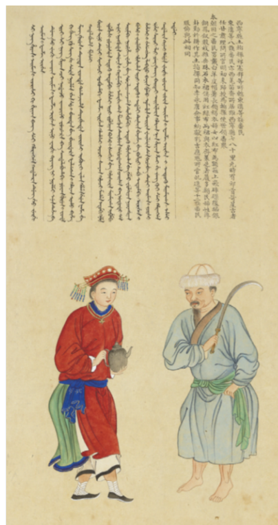
Xining xiantu 西寧縣土 "Xining County." In: Qing Imperial Illustrations of Tributary Peoples (Huang Qing Zhigongtu) . (Leiden, NL : Koninklijke Brill NV, 2022), p. 340-341.

Huang Qing Zhigong tu all contained illustrations (not always in colour), most often of a woman and a man during traditional activities. As a third element, a culture-specific attribute like a weapon or musical instrument was often added. Items such as jugs, spears, staffs, or stringed boxes were recurrent motifs, adding layers of cultural and symbolic significance to the illustrations. For example, Dougou and other Fanmin people are depicted with the teapot (woman) and the curved sword (man), which shows the gender roles and positions in that society. The teapot could symbolize domesticity, nurturing, or the role of caretaker. It might suggest that women in that society are primarily responsible for household tasks, hospitality, or nurturing relationships. The sword, on the other hand, symbolizes strength, protection, or authority, suggesting that men in society are primarily associated with defence, leadership, and safeguarding the community. Another interpretation could be that this kind of sword represents tools used in farming or agriculture, implying that men also play a significant role in agricultural activities and land cultivation.